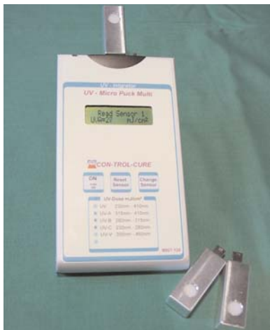
Micro Puck Multi