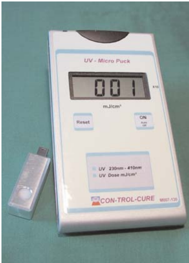
Micro Puck Radiometer

The sensors are available as either a rectangular or a round model. Both sensors work with both base units and are available in each of the 4 different UV measuring ranges.